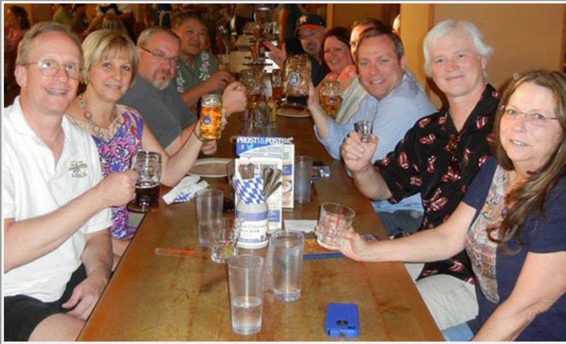
Acacians at the the 2014 AABC in Las Vegas

The 2015 AABC will take place at the Red Rock Casino, located several miles off the Las Vegas strip. Planned activities include a bowling tournament and social gathering, a brotherhood dinner, and educational programming on topics relevant to Acacia. Spouses and significant others are welcome to join the fun.