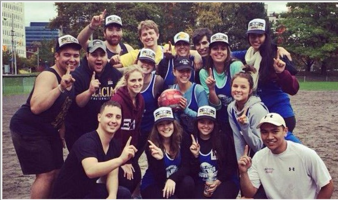
Carleton Acacia plays kickball with Ottawa Tri-Delta for St. Jude's Children's Research Hospital

In this issue of The Crest, we offer a few different ways for alumni to support Acacia in its efforts this year. We ask that you please begin by forwarding this email to other brothers with whom you remain in regular contact, or reply to this email with a contact list of brothers from your chapter / era. Next, we offer a new and easy way to support Acacia financially, and an opportunity to enjoy the fruits of brotherhood with an Acacia alumni weekend in January in Las Vegas. And finally, be sure to let us know of your current mailing address if you've recently moved so we can reach you with The TRIAD later this fall. With your support, this will be a banner year for Acacia.