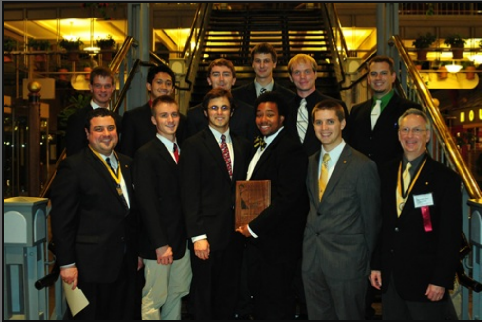
Superior Chapter - Iowa State