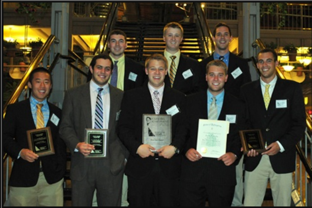
Outstanding Chapter - Penn State